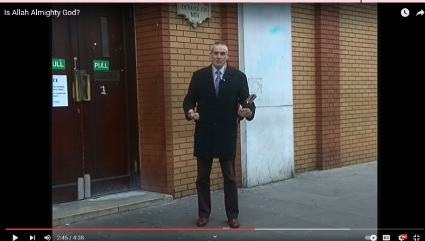
Asking if Allah is the same as Almighty God. Video recorded outside the East London Mosque