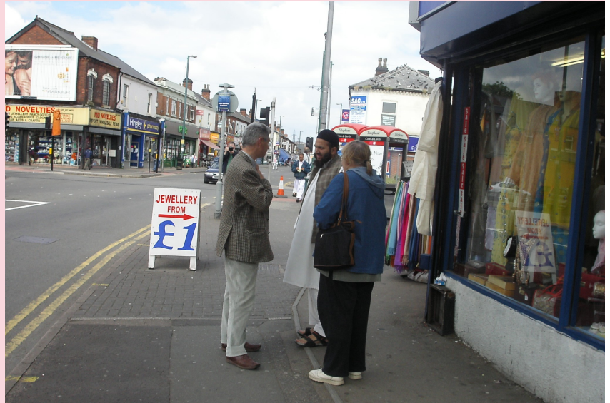
Engaging with Muslims on Alum Rock Road

Accordingly, without delay, we took to the Alum Rock Road with Gospel tracts, some indeed in Urdu. Far from encountering hostility, we found Alum Rock's Muslims keen to engage around matters of faith. By the kind of coincidence only the Lord can bring about, that same area was where we would support Muslim parents standing up for the innocence of their children against homosexual sex educators in Parkfield Primary School eleven years later.