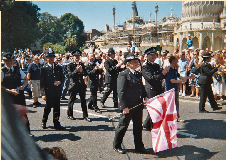
Africans are shocked to see a British Chief of Police, here in Brighton, leading a gay pride parade.

Many Kenyans aspire to be like the UK, but the pastors were shocked to learn that a quarter of all pregnancies end in abortion, that half of the children born in Britain grow up without their natural father, and that London can see 100,000 homosexuals, led by senior politicians, openly flaunting their depravity through its streets.