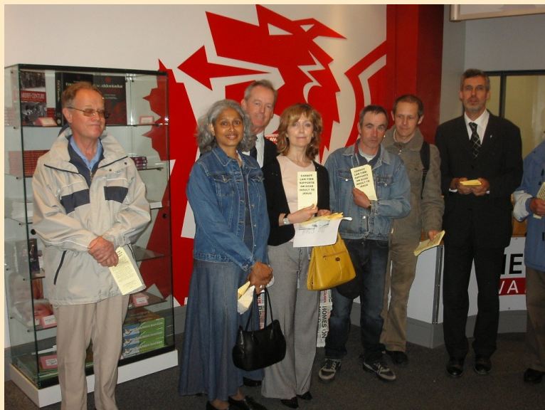
Flash Praise and Prayer at the South Wales Echo