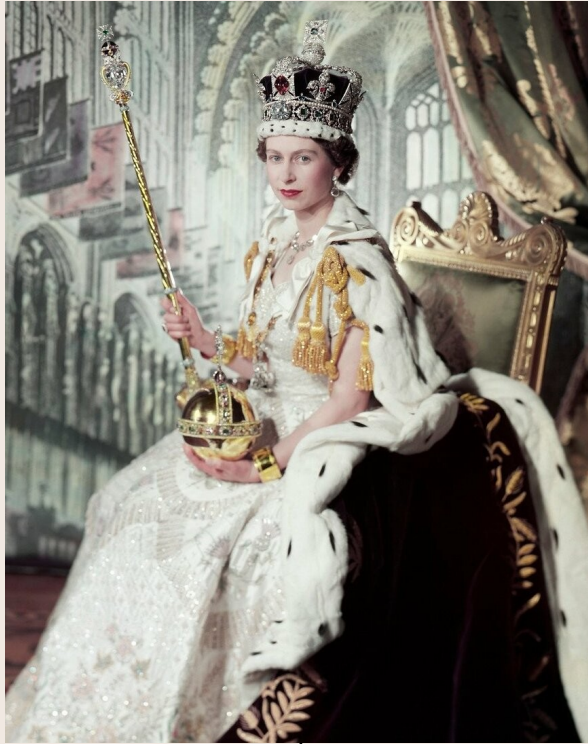
HLM The Queen holds the Sceptre and the Orb under the Cross at her Coronation on 2nd June 1953.

From the start, Christian Voice was dedicated to analysing current events in the light of scripture and giving individual Christians the information they need to pray, seek the Lord and take action. We promptly published a Bible Reading plan called 'Lamplight' to