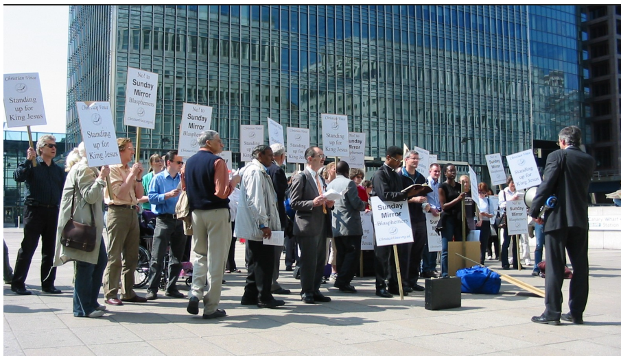
Our first ever street witness, at Canary Wharf