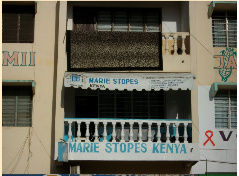
Illegal abortions carried out by Marie Stopes International in Kenya are 90% funded by the British taxpayer.